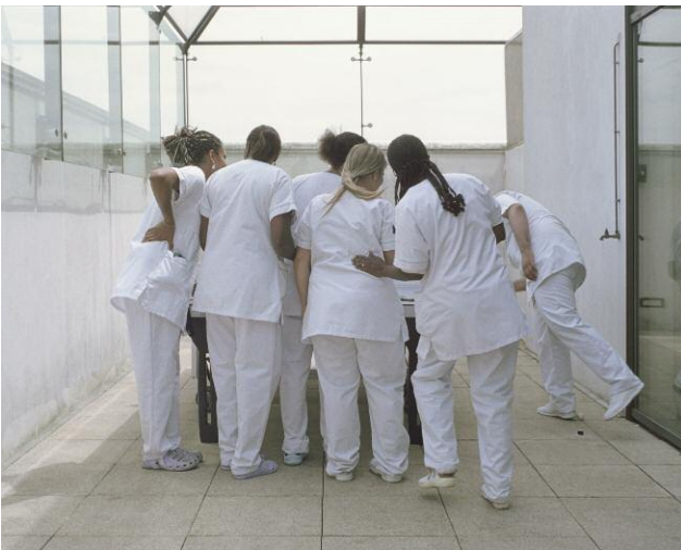
Press image 9 from the series »Bellevue Hospital«