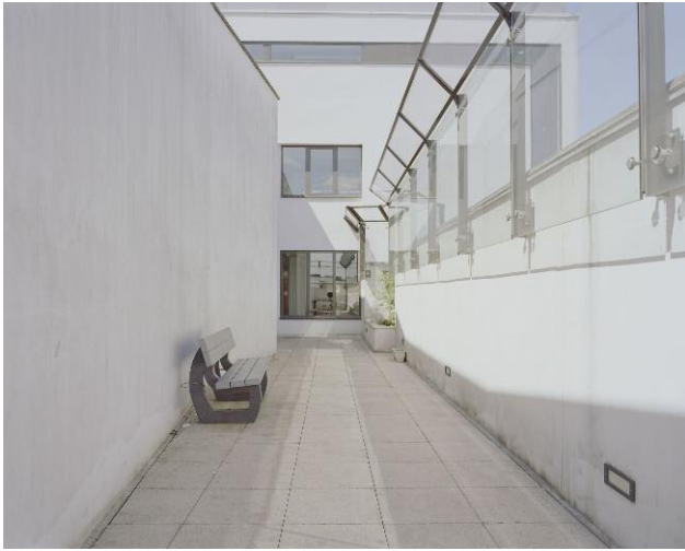
Press image 7 from the series »Bellevue Hospital«