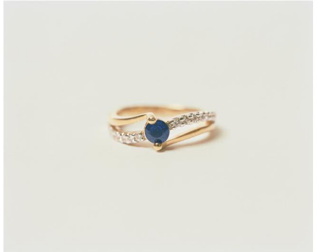
Press image 2 from the series »Objects and Constraints«