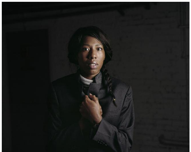
Press image 4 from the series »Psychadascalia«