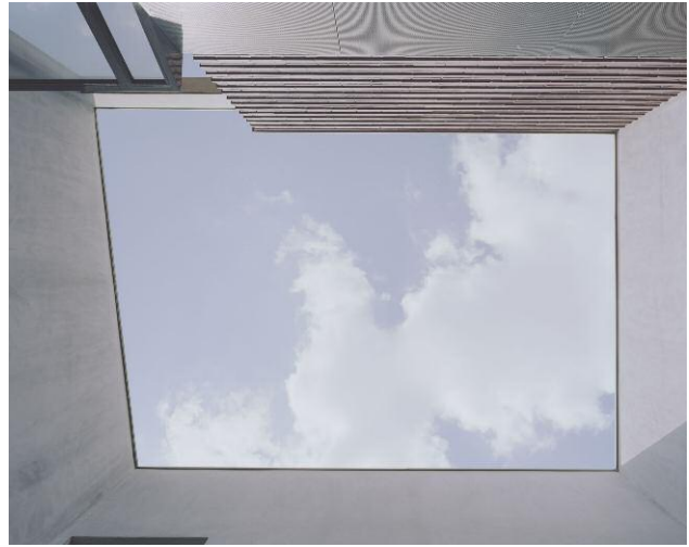
Press image 8 from the series »Bellevue Hospital«