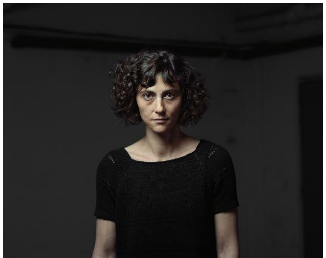
Press image 6 from the series »Psychadascalia«